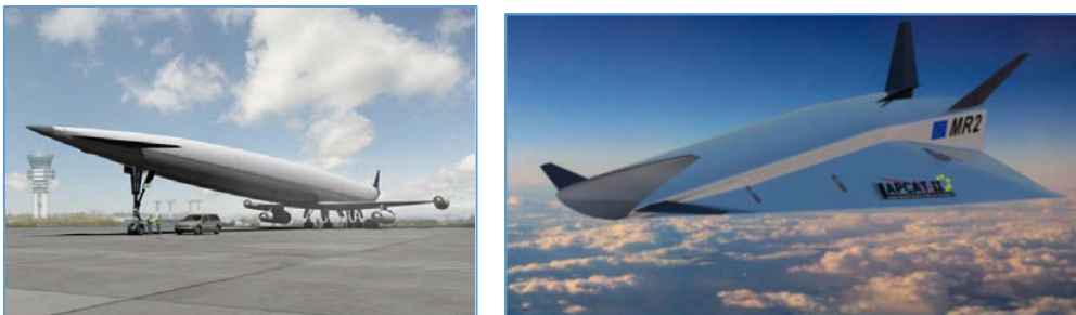
Figure 1: LAPCAT-II A2 cruiser (left) and LAPCAT-II MR2.4 vehicle (right)

This STS will present the status of technology developments in European research institutions, university and industries, showing some key achievements that are contributing to enhance the accuracy and fidelity of design tools to be used for future high-speed passenger aircraft.